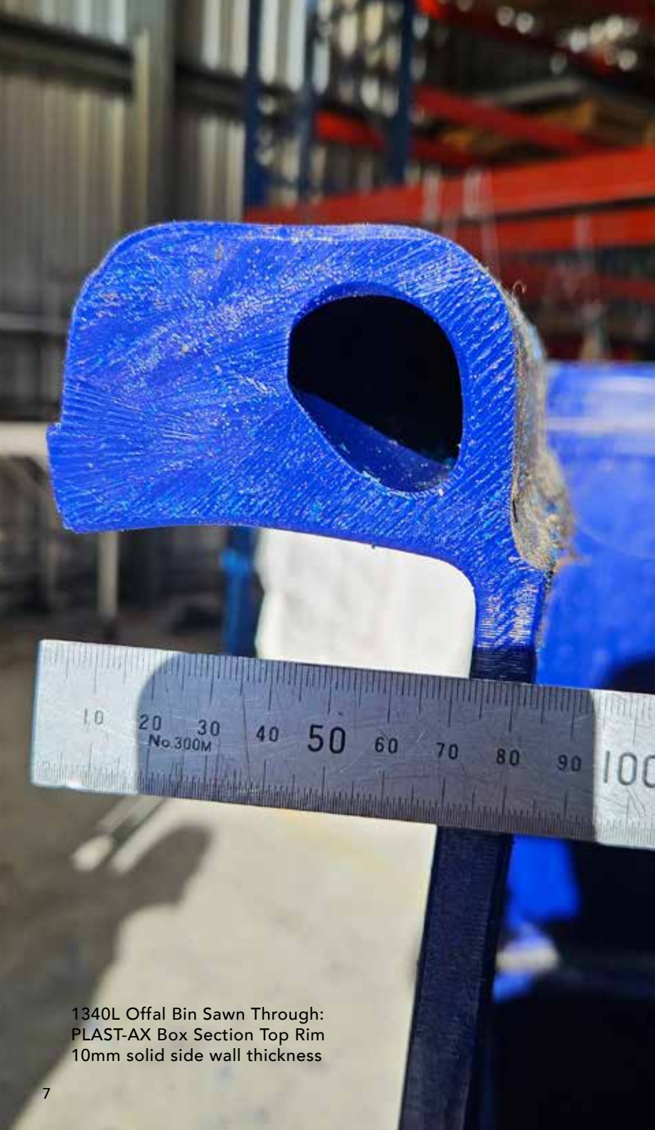
1340L Offal Bin Sawn Through: PLAST-AX Box Section Top Rim 10mm solid side wall thickness