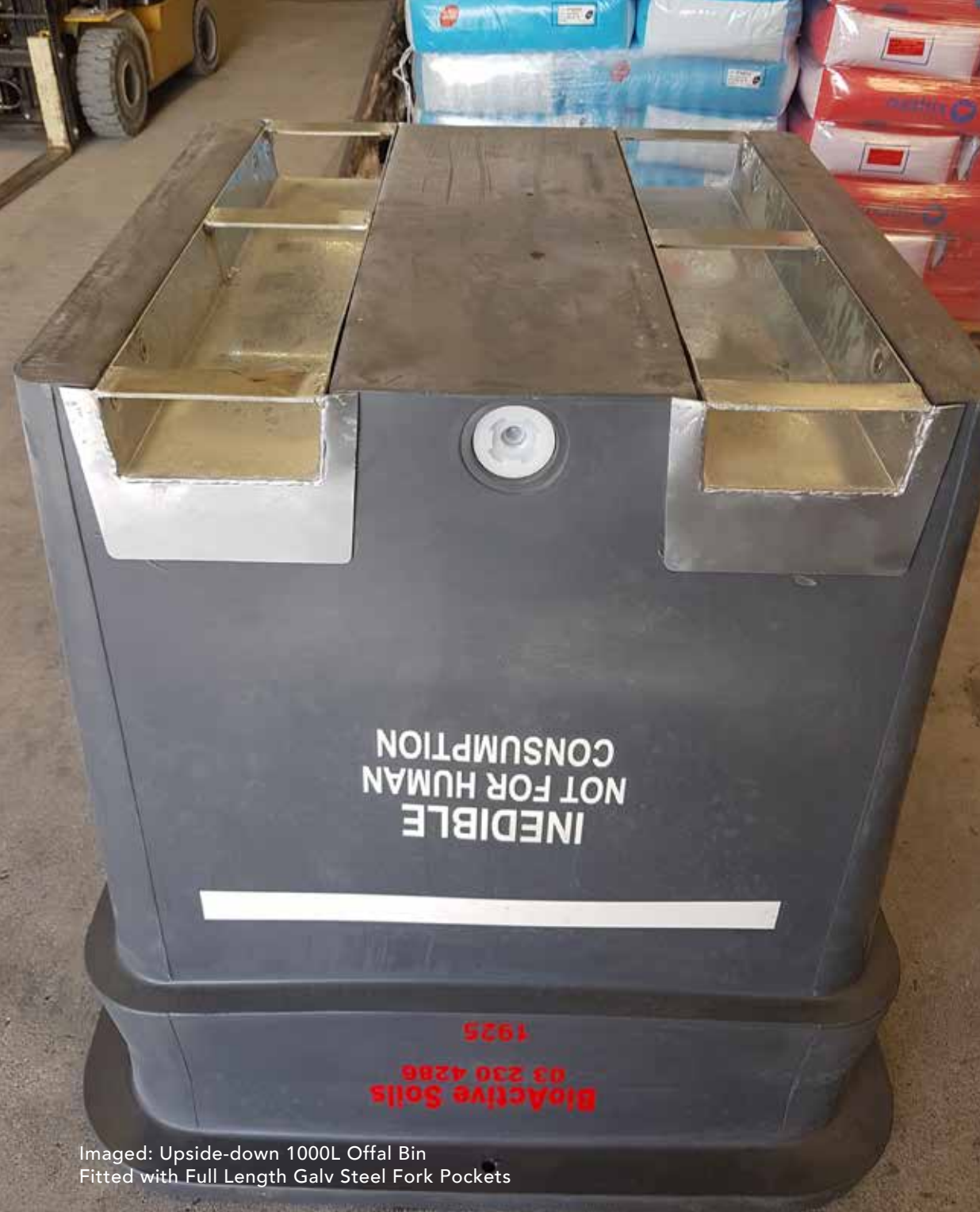
Imaged: Upside-down 1000L Offal Bin Fitted with Full Length Galv Steel Fork Pockets