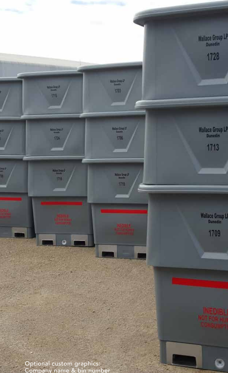
Optional custom graphics: Company name & bin number