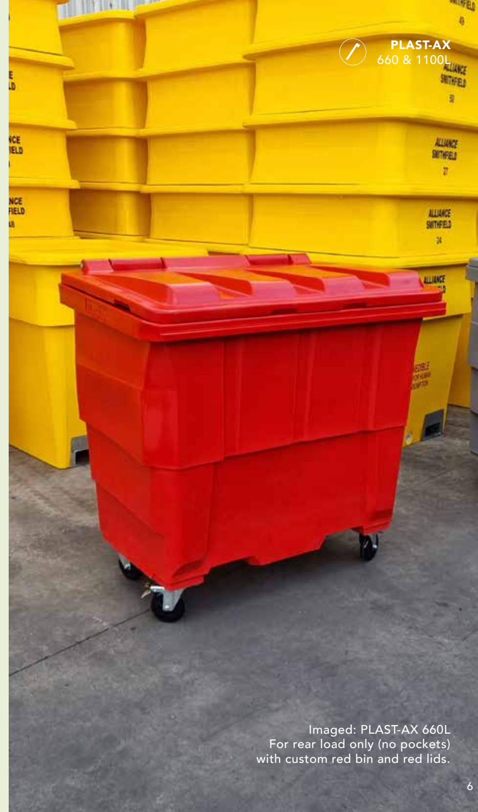
Imaged: PLAST-AX 660L For rear load only (no pockets) with custom red bin and red lids.

Comes with a PLAST-AX Single piece lid. Available with castor wheels and fixings.