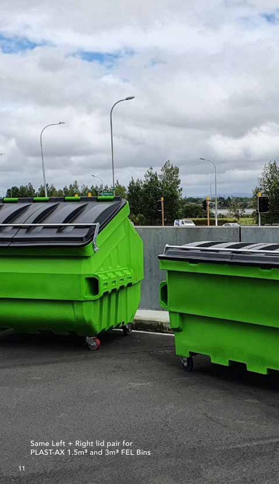
Same Left + Right lid pair for PLAST-AX 1.5m 3 and 3m 3 FEL Bins