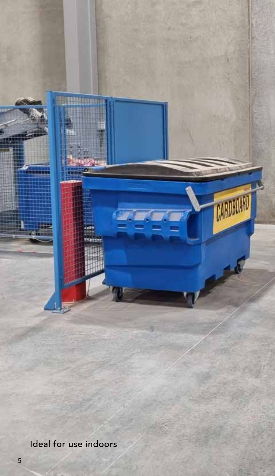
Ideal for use indoors