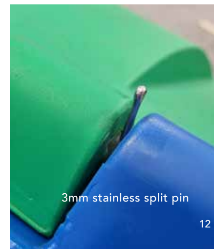
3mm stainless split pin