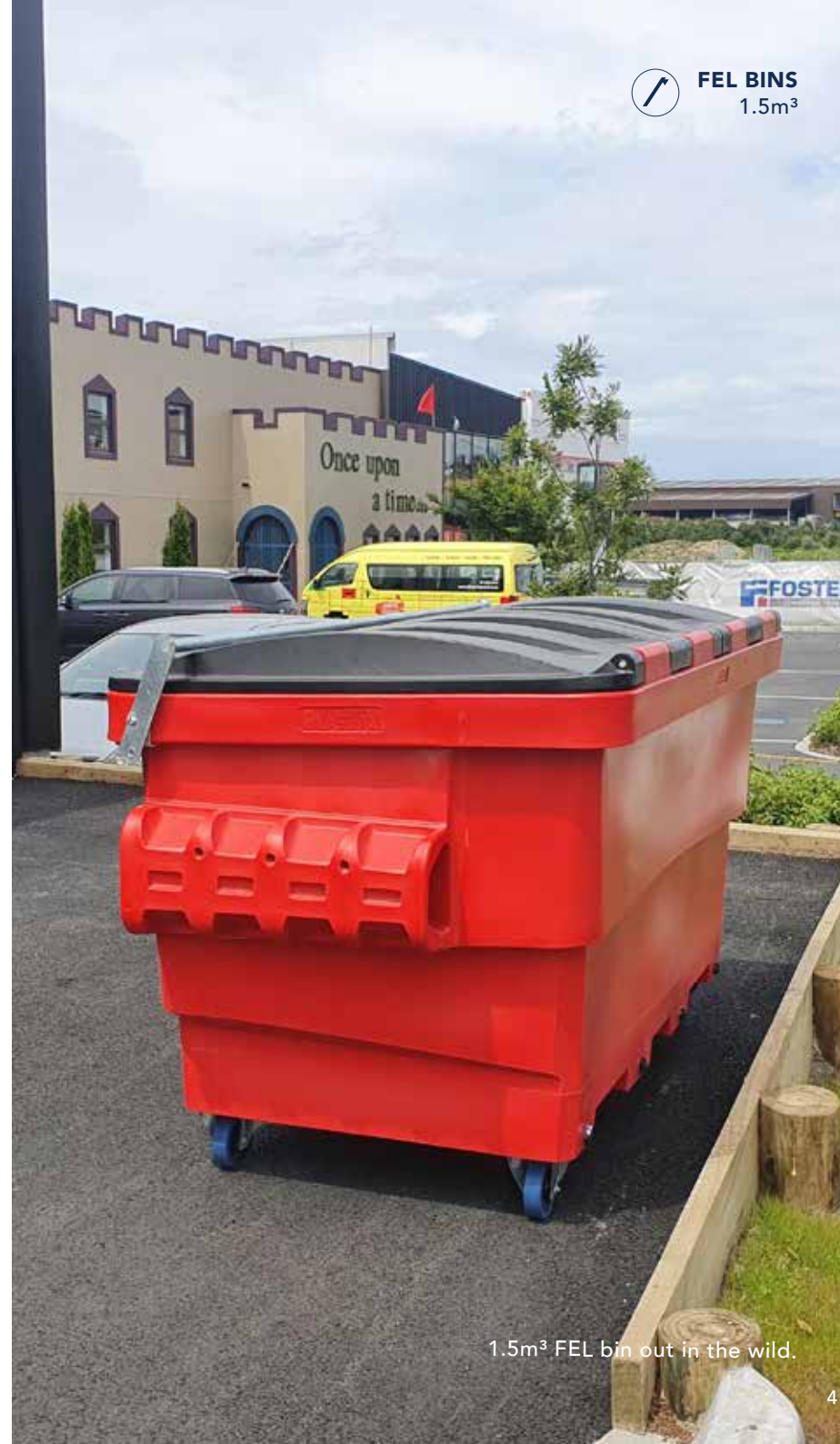
1.5m 3 FEL bin out in the wild.

Available with optional lock bar, castor wheels and stainless fixings.