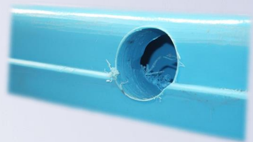
Box Section Top Rim - (cut out showing 20mm thickness)

Contact us to discuss the best bin for you